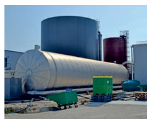
Hot water storage