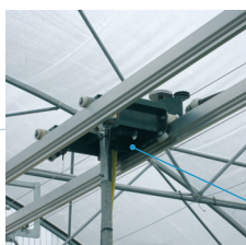
Stability: double rail truck

an increasingly important issue, your partner in irrigation offers the best solutions for designing your watering equipment.