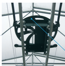
Long length: cable truck

with unparalleled know-how is at your service. You will benefit from their unique experience in the domain of greenhouse and exterior irrigation.